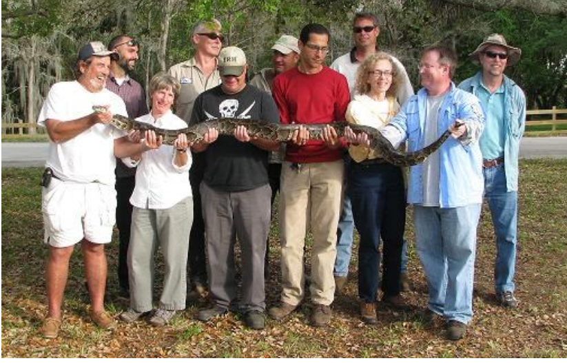
St. Lucie County Master Naturalists members demonstrate their python handling skills at a Python Patrol training workshop.

In 2011, a steering committee was formed to direct the formation of an FMNP chapter in St. Lucie County. With the adoption of a mission statement and bylaws, the St. Lucie County Master Naturalists (SCMN) officially became a chapter in December of that year.