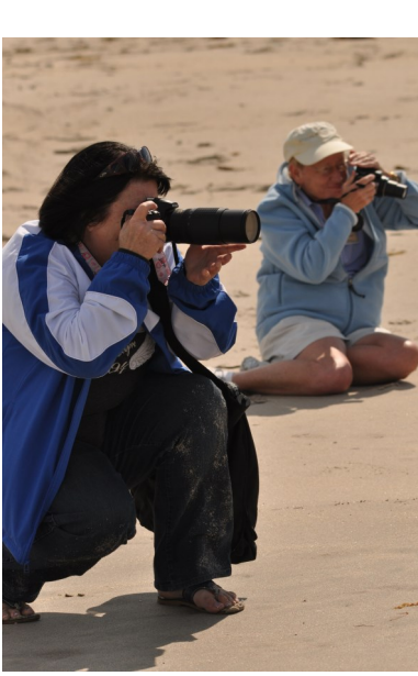
Photography workshop participants practice their techniques on the beach.

The SCMN currently has 30 members (up from 12 in 2011) who volunteer for a variety of educational and outreach activities in St. Lucie and neighboring counties throughout the year. This year, chapter members have assisted with the Nature Conservancy's Python Patrol campaign to educate the public about the environmental danger posed by Burmese pythons in Florida and elicit reports of sightings. In partnership with St. Lucie County UF/IFAS Cooperative Extension and the St. Lucie County Audubon Society, the SCMN hosted a photography workshop in April where attendees learned both the basics of wildlife and natural areas photography as well as species identification tips. Other notable events that SCMN members have participated in include the Space Coast Birding Festival, Indian River Cleanup and the Vero Beach Oyster Festival, among others. As of October 2012, the SCMN members had volunteered a total of 1,392 hours at 39 events - quite a remarkable achievement!