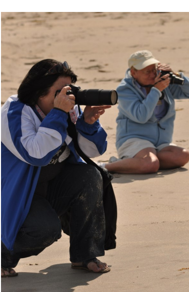
Photography workshop participants practice their techniques on the beach.

The SCMN currently has 30 members (up from 12 in 2011) who volunteer for a variety of educational and outreach activities in St. Lucie and neighboring counties throughout the year. This year, chapter members have assisted with the Nature Conservancy's Python Patrol campaign to educate the public about the environmental danger posed by Burmese pythons in Florida and elicit reports of sightings. In partnership with St. Lucie County UF/IFAS Cooperative Extension and the St. Lucie County Audubon Society, the SCMN hosted a photography workshop in April where attendees learned both the basics of wildlife and natural areas photography as well as species identification tips. Other notable events that SCMN members have participated in include the Space Coast Birding Festival, Indian River Cleanup and the Vero Beach Oyster Festival, among others. As of October 2012, the SCMN members had volunteered a total of 1,392 hours at 39 events - quite a remarkable achievement!