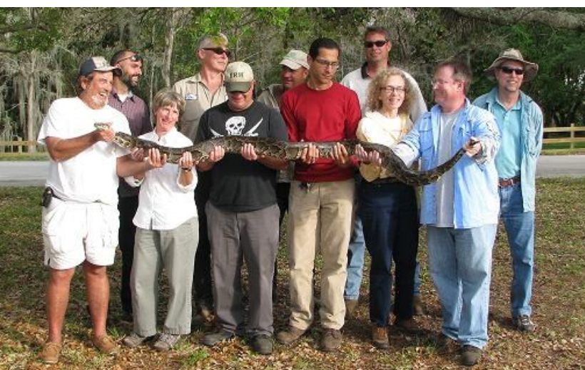
St. Lucie County Master Naturalists members demonstrate their python handling skills at a Python Patrol training workshop.

In 2011, a steering committee was formed to direct the formation of an FMNP chapter in St. Lucie County. With the adoption of a mission statement and bylaws, the St. Lucie County Master Naturalists (SCMN) officially became a chapter in December of that year.