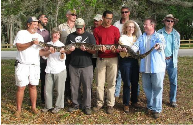
St. Lucie County Master Naturalists members demonstrate their python handling skills at a Python Patrol training workshop.

In 2011, a steering committee was formed to direct the formation of an FMNP chapter in St. Lucie County. With the adoption of a mission statement and bylaws, the St. Lucie County Master Naturalists (SCMN) officially became a chapter in December of that year.