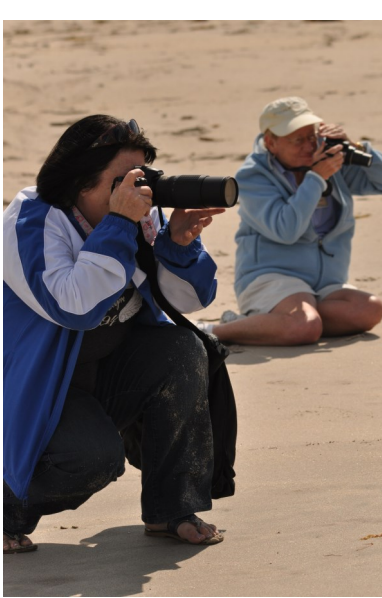
Photography workshop participants practice their techniques on the beach.

The SCMN currently has 30 members (up from 12 in 2011) who volunteer for a variety of educational and outreach activities in St. Lucie and neighboring counties throughout the year. This year, chapter members have assisted with the Nature Conservancy's Python Patrol campaign to educate the public about the environmental danger posed by Burmese pythons in Florida and elicit reports of sightings. In partnership with St. Lucie County UF/IFAS Cooperative Extension and the St. Lucie County Audubon Society, the SCMN hosted a photography workshop in April where attendees learned both the basics of wildlife and natural areas photography as well as species identification tips. Other notable events that SCMN members have participated in include the Space Coast Birding Festival, Indian River Cleanup and the Vero Beach Oyster Festival, among others. As of October 2012, the SCMN members had volunteered a total of 1,392 hours at 39 events - quite a remarkable achievement!