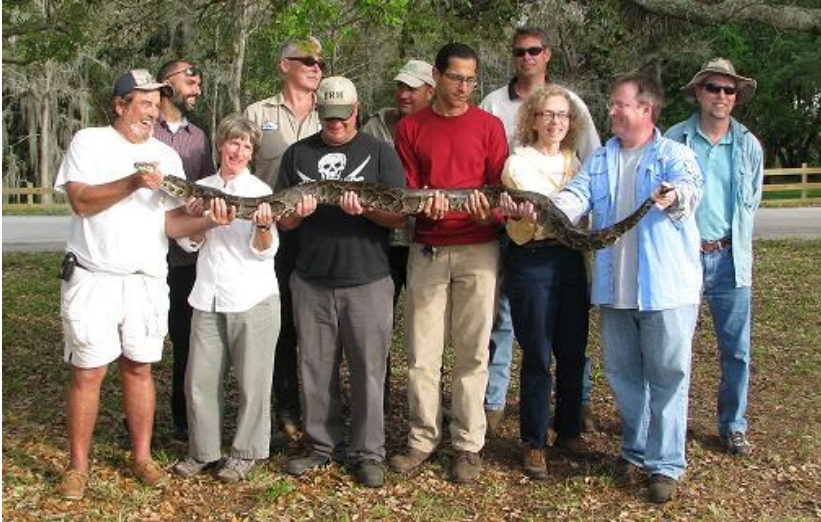
St. Lucie County Master Naturalists members demonstrate their python handling skills at a Python Patrol training workshop.

In 2011, a steering committee was formed to direct the formation of an FMNP chapter in St. Lucie County. With the adoption of a mission statement and bylaws, the St. Lucie County Master Naturalists (SCMN) officially became a chapter in December of that year.