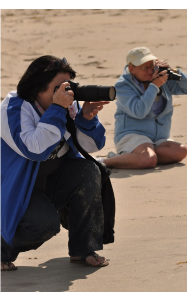
Photography workshop participants practice their techniques on the beach.

The SCMN currently has 41 members who volunteer for a variety of educational and outreach activities in St. Lucie and neighboring counties throughout the year. This year, chapter members have assisted with the Nature Conservancy's Python Patrol campaign to educate the public about the environmental danger posed by Burmese pythons in Florida and elicit reports of sightings. In partnership with St. Lucie County UF/IFAS Cooperative Extension and the St. Lucie County Audubon Society, the SCMN hosted a photography workshop in April where attendees learned both the basics of wildlife and natural areas photography as well as species identification tips. Other notable events that SCMN members have participated in include the Space Coast Birding Festival, Indian River Cleanup and the Vero Beach Oyster Festival, among others. As of October 2012, the SCMN members had volunteered a total of 1,392 hours at 39 events - quite a remarkable achievement!