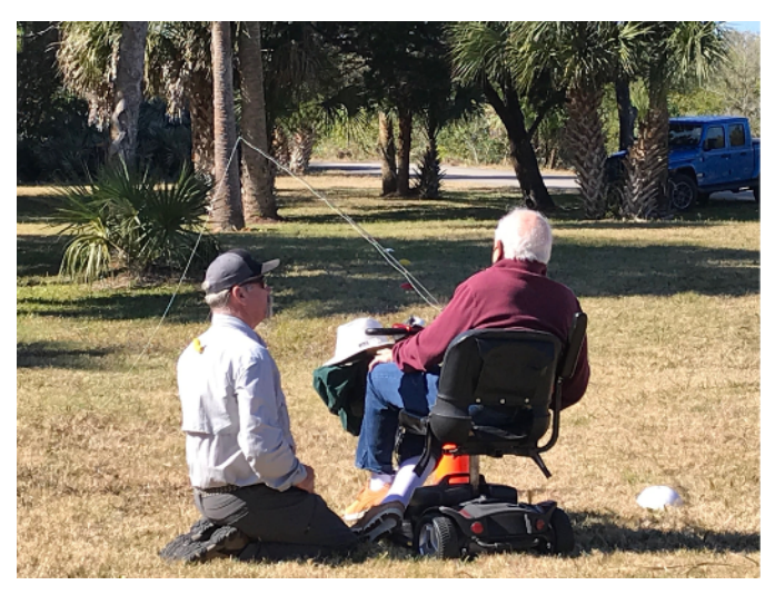
Member participating in a flyfishing class at the Battle Island Adventure Club.

Finally, on behalf of the Board, I want each one of our members to know how much we appreciate you. Without you, quite literally, we would not have a Friends Group. But more than that and especially this year, it is supremely rewarding to know that we can count on you, your interest, and your participation. Thank You.