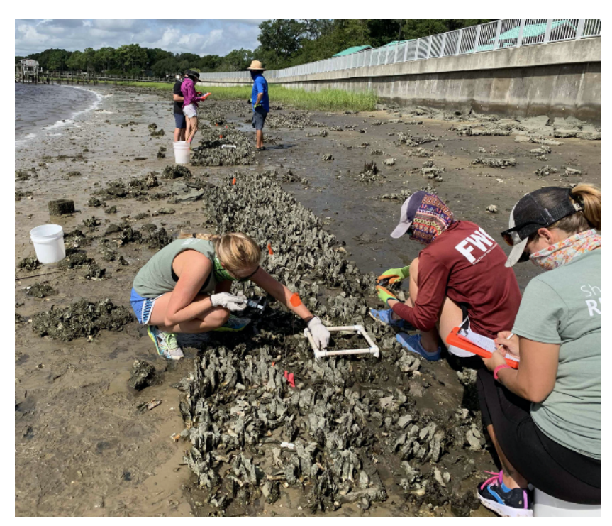
Volunteers monitor a Nassau County living shoreline.

• Identifying and removing an invasive beach plant, beach vitex ( Vitex rotundifolia ). In addition to finding and reporting this plant, FMNP volunteers have been able to remove over 80% of the known population in our area – staying ahead of the invasive population curve.