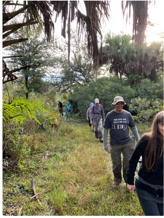
Rookery Bay Environmental Learning Center