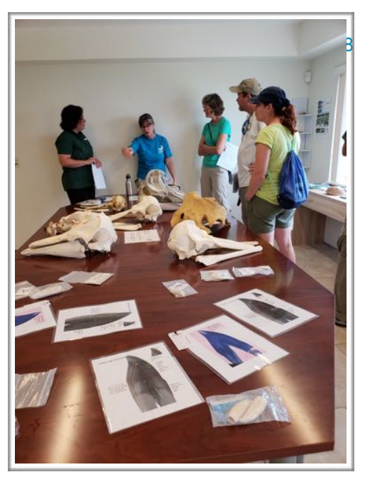
Space Coast Chapter members tour the Hubbs-Seaworld Research Institute

All in all, a perfect day for naturalists.