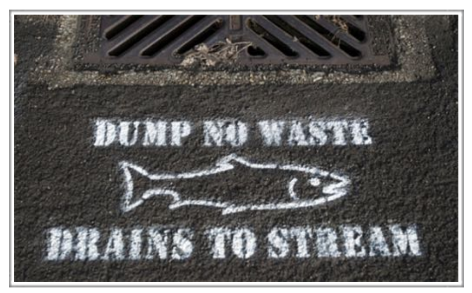
Example of stenciling to raise awareness of stormwater pollution

There are also opportunities to volunteer in most communities. Consider organizing a local trash pickup event to reduce large pollutants from your local waterways. OR join a local effort to label storm drains and raise awareness about <u>stormwater pollution</u>. If you're interested in water quality monitoring project, check out Florida's <u>LAKEWATCH</u>. Remember, all of Florida's waterways will thank you!