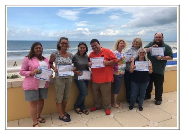
Eight teachers in Volusia County complete the FMNP Coastal Module with scholarships from the local Rotary Clubs

In June, eight teachers from Volusia County were awarded partial scholarships from four local Rotary Clubs to participate in the FMNP Coastal Systems Module. The participants all plan to use the information they learned in their K-12 classrooms this upcoming year!