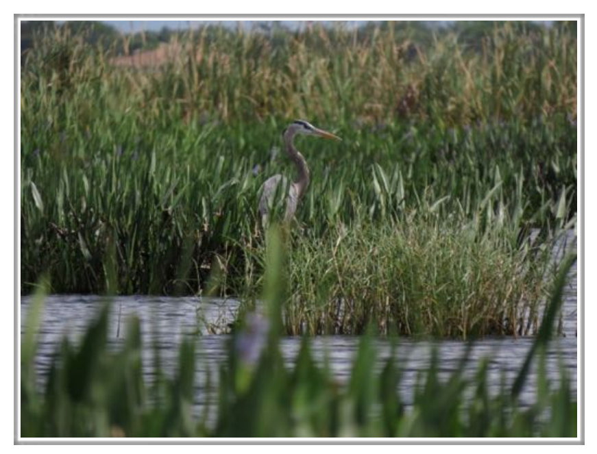
A great blue heron takes refuge in a freshwater wetland in south Florida

Everything we do affects water quality. From accidentally misreading a label on a pesticide, to simply trying to get a job done before it rains, to unintentionally littering, our actions as individuals can add up in the environment and their consequences grow. Florida's