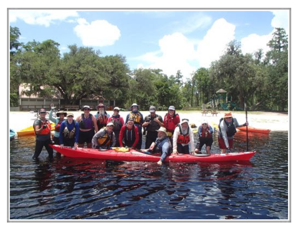
Paddlers attend a Certified Kayak Trip Leader Course with the American Canoe Association at Lake Louisa State Park

award-winning state park system gives Master Naturalists the opportunity to help others rediscover the awe and wonder in nature by assisting with public guided paddle trips at your local state park. The Paddlesport Program also seeks to fill much needed trip leader positions by providing training through the American Canoe Association (ACA) at Lake Louisa State Park.