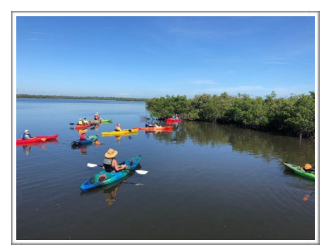
The teachers learn about coastal systems in Florida while on a kayak field trip

The participants praised the FMNP saying, "It was a wonderful way to receive in depth knowledge about the importance of coastal ecosystems while having a great time!" The participants, instructors, and FMNP Office also want to send out a big "THANK YOU" to the four rotary clubs that contributed to the scholarships: Rotary Club of Debary-Deltona-Orange City, Rotary Club of Downtown DeLand, Rotary Club of DeLand, and Rotary Club of DeLand Breakfast.